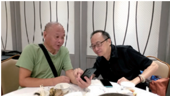
義工教服務對象使用智能電話。 The volunteer shared with the user the application of smartphone and apps.

The scheme was carried out in groups and regular review meetings were conducted with volunteers. It was found that volunteers, who approached users like a friend, were more able to build up friendship and respond to the service users' needs, for example, volunteer introduced the application of smartphone or apps to help users reintegrating into social culture. In addition, volunteers listened without judgment and provided an appropriate context to alleviate service users' psychological and emotional distress, meanwhile, as a role model, they motivated people to become user volunteers and contribute to society.